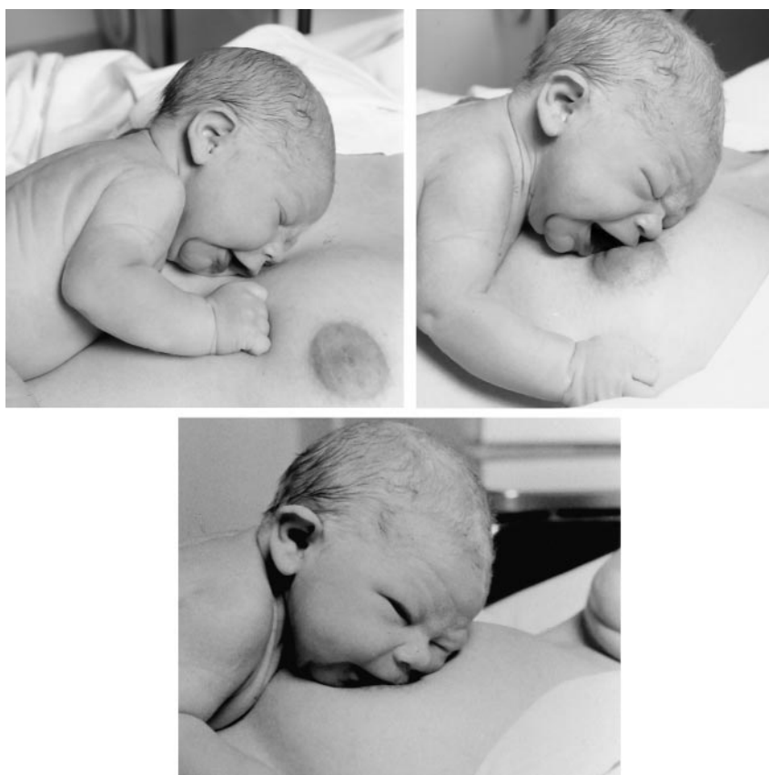
Fig 1. An infant boy <1 hour old crawls up his mother's body and latches onto her breast by himself, clockwise from left.